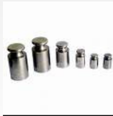
Less* Weight (Volume)